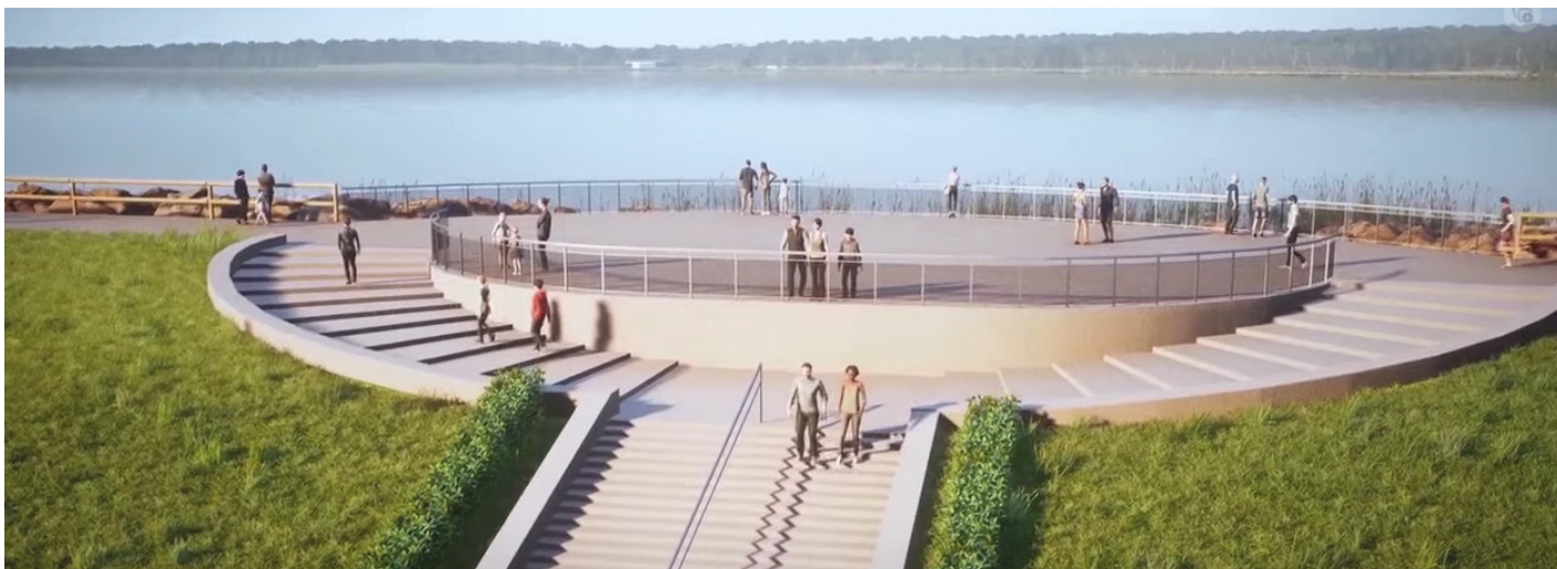
A public viewing area is planned at Havant Thicket Reservoir

For more details, please visit the Havant Thicket Reservoir webpages at: Potential future uses of Havant Thicket Reservoir | Havant Thicket Reservoir project (engagementhq.com) .